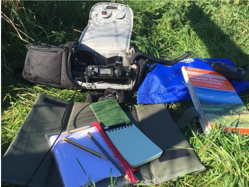
G4YBU's lightweight HF SOTA portable station

There are 15 summits in the Southern England (G/SE) SOTA region to choose from. Summits are located in an area from Wiltshire in the west through to Kent in the east and south to the Isle of Wight and the South Downs. If you're thinking of operating from a summit, take a look at the SOTA region map and the info for the summit on www.sotadata.org.uk – this will give you previous activators blogs, really useful information on accessing the summit, suggested car parking and the recommended routes to the summit.