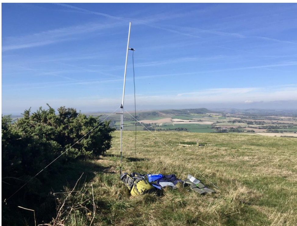
G4YBU 2m operating position on Wilmington Hill G/SE-011 with views across the South Downs